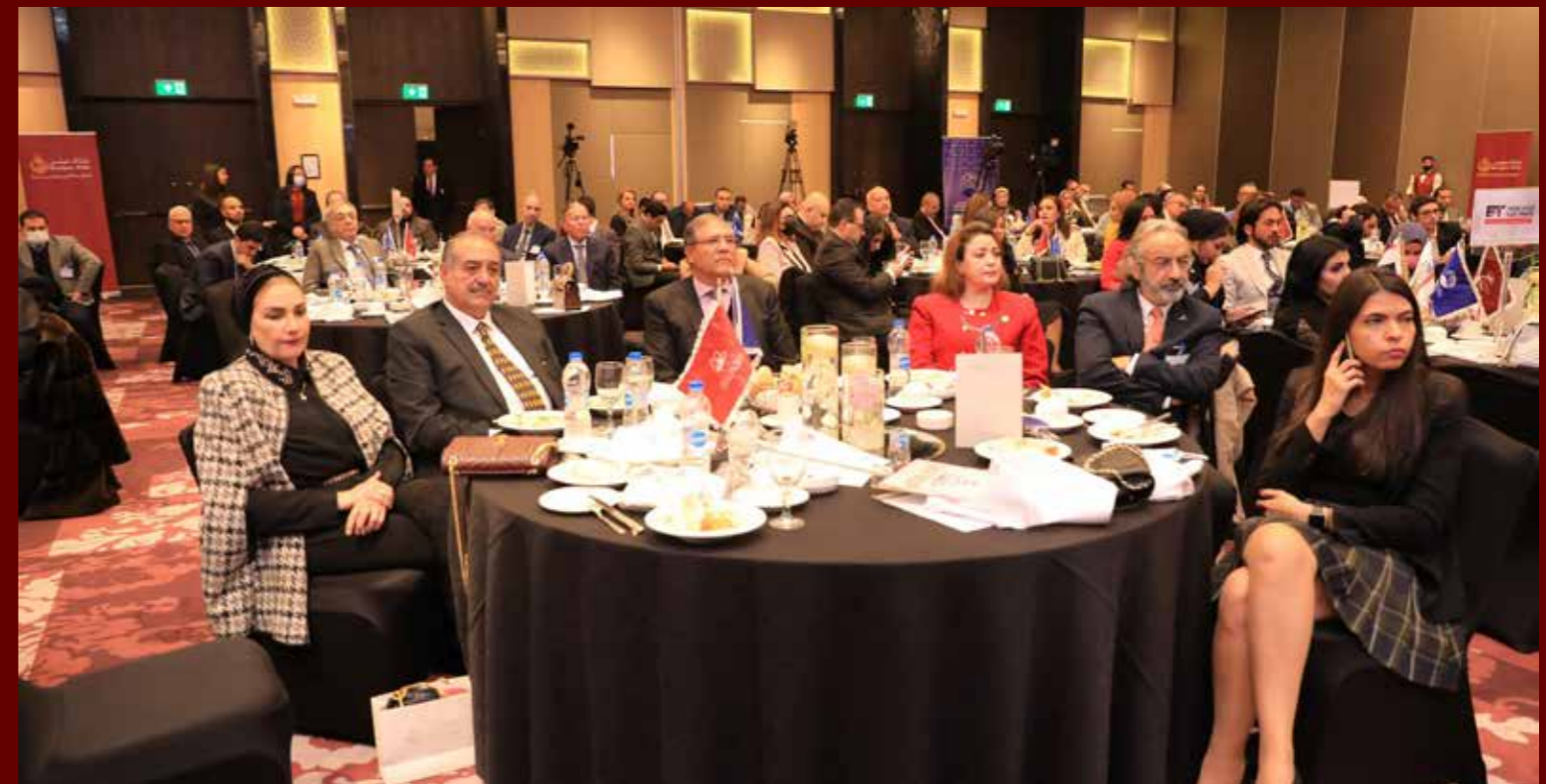
Sadat Group Guests