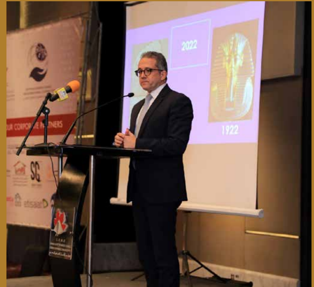
H.E. Dr. Khaled Al-Anani