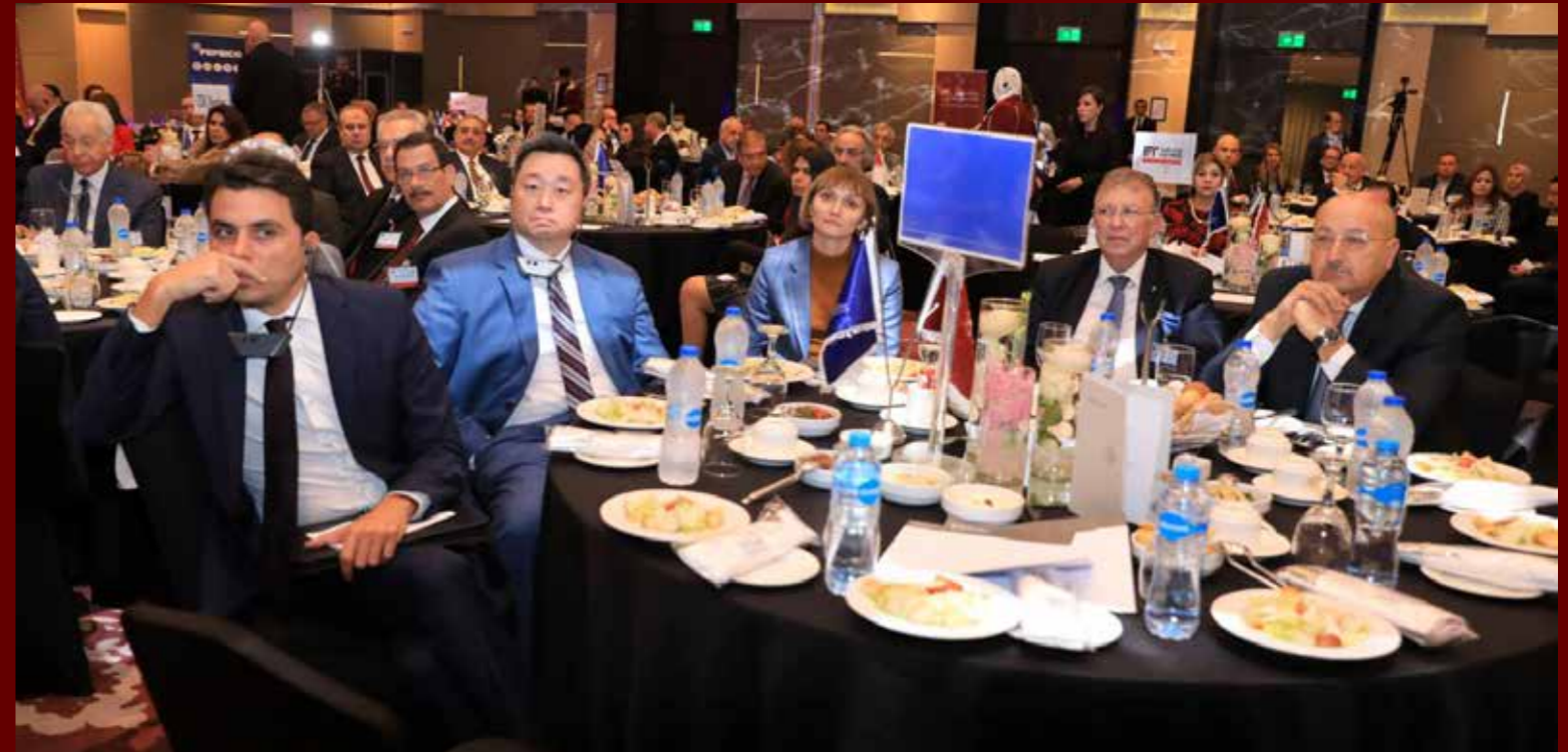
CEBC & ECIC VIP Guests