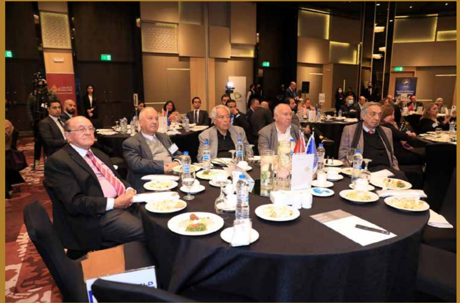
Tam Oilfield Services Guests

He also added that Egypt won the award for the best propaganda film in the Middle East for the category of exceptional stories about sustainable tourism, during the international competition launched by the World Tourism Organization. The minister pointed to the celebrations of the Royal Mummies Procession and Luxor Rams Road, and their great impact in promoting Egyptian tourism and creating more passion among the peoples of the world to visit Egypt and see ancient Egyptian antiquities, in addition to their contribution to raising the tourist and archaeological awareness among the masses of the Egyptian people.