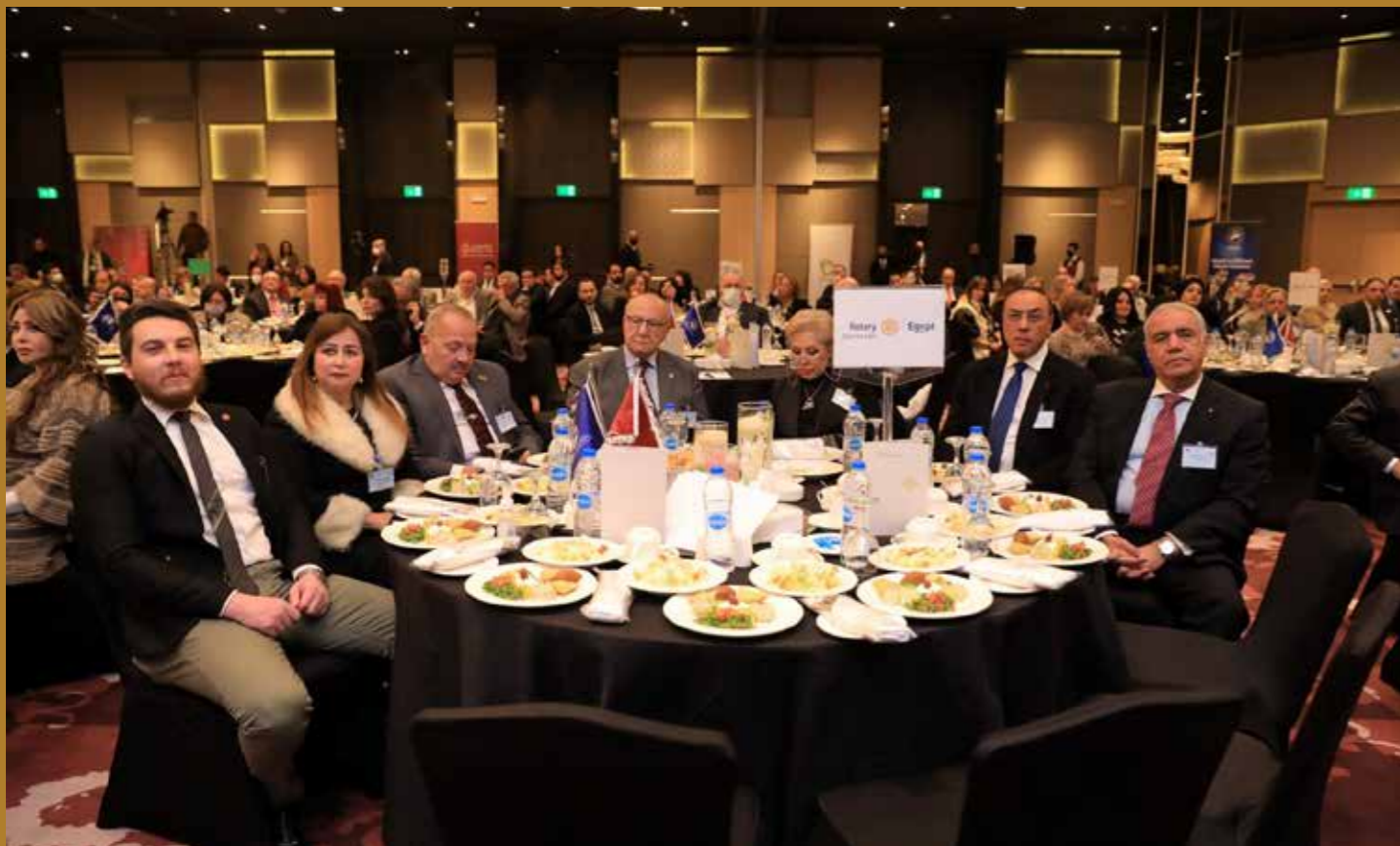
Rotary Egypt Guests