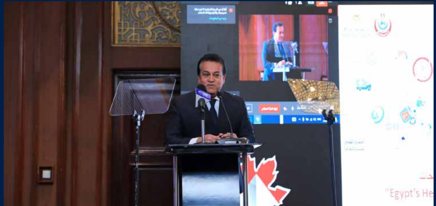
H.E. Dr. Khaled Abd El-Ghfar