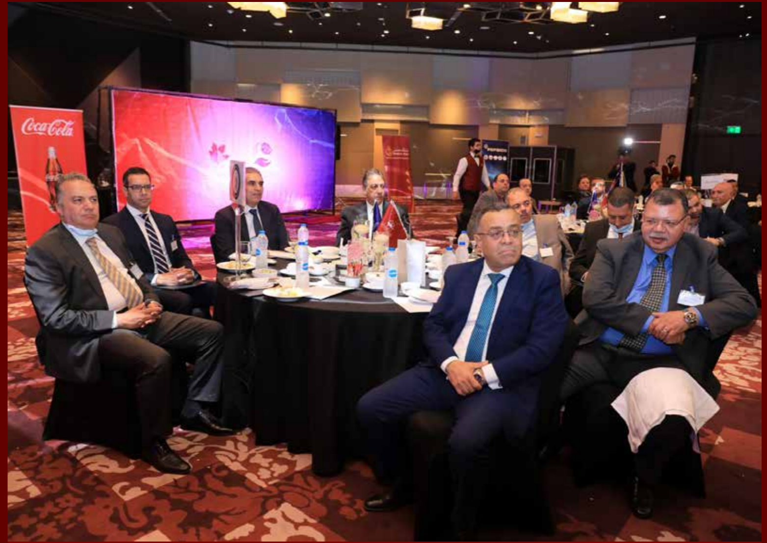
Ministry of Petroleum Guests