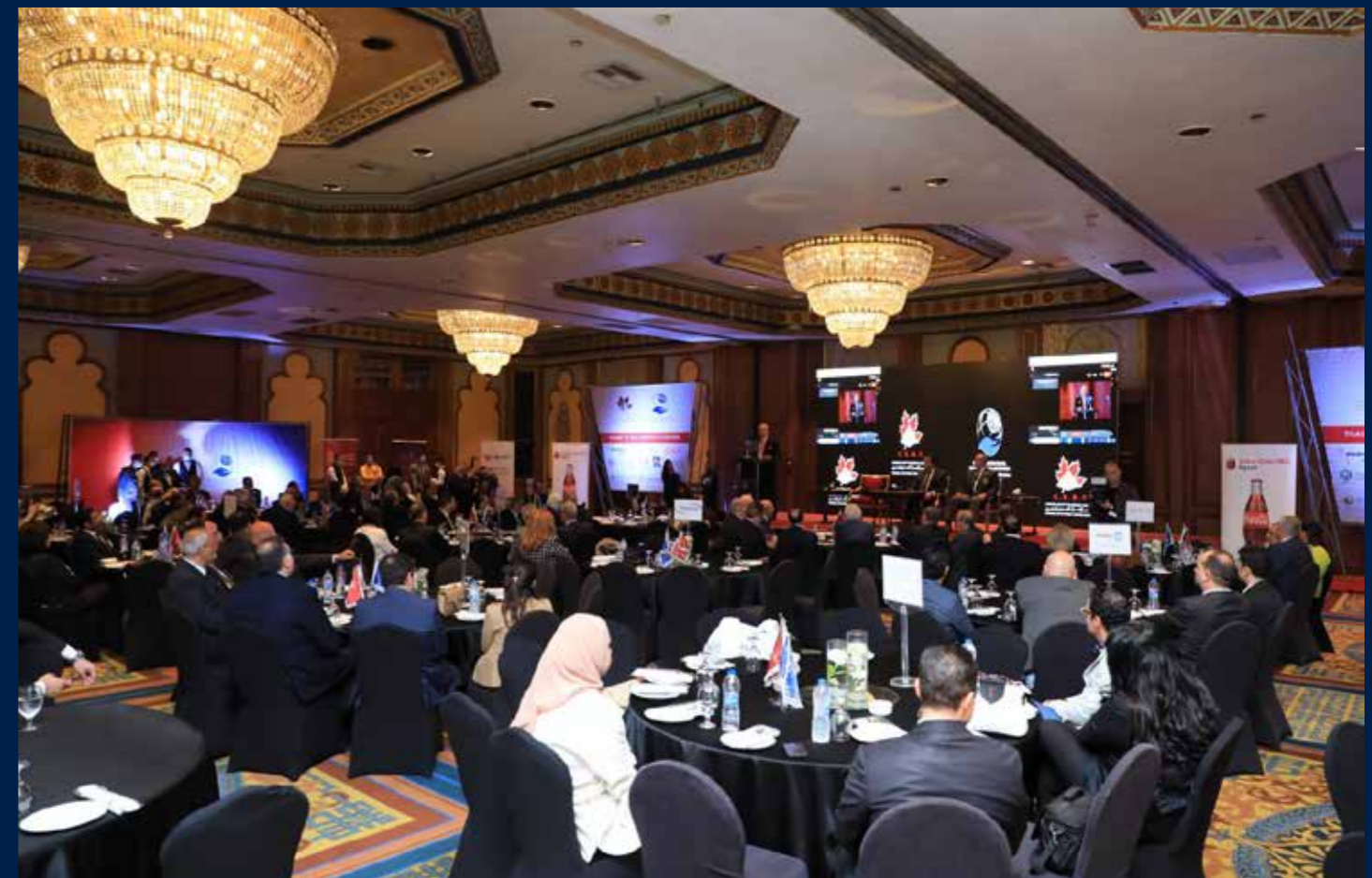
The Panelists & the Attendees