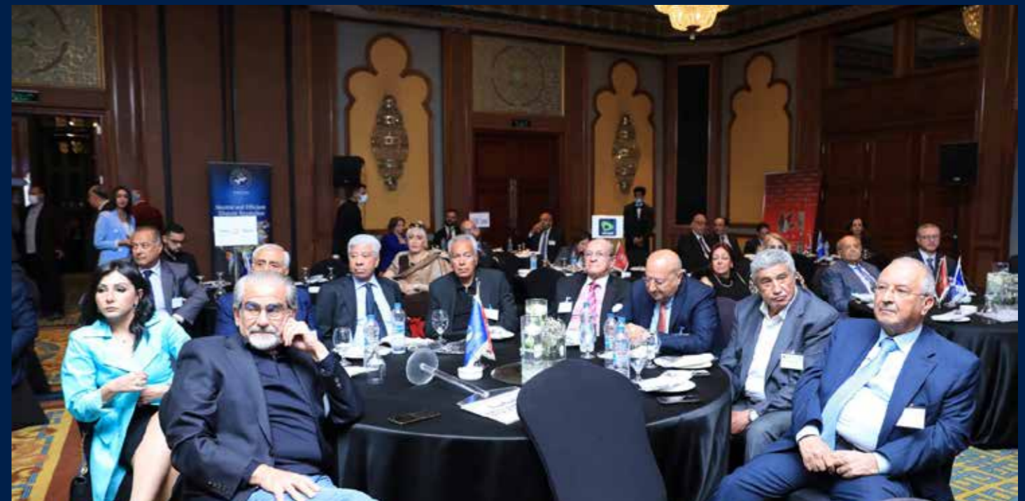
Tam Oil Field Guests