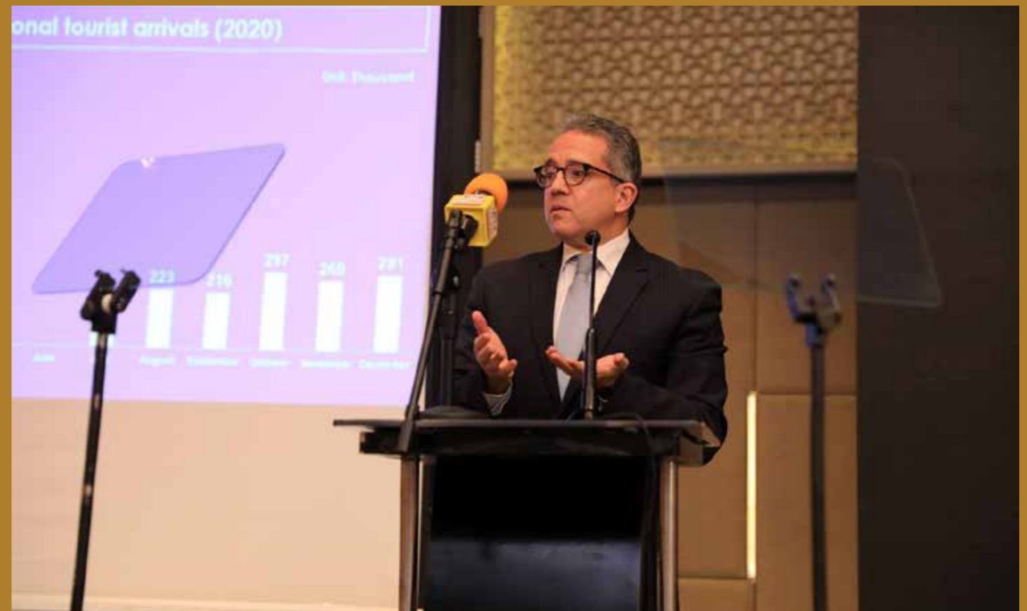
H.E. Dr. Khaled Al-Anani