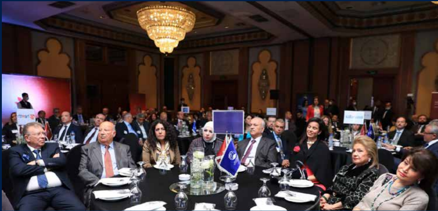
Part from our CEBC & ECIC VIP Guests