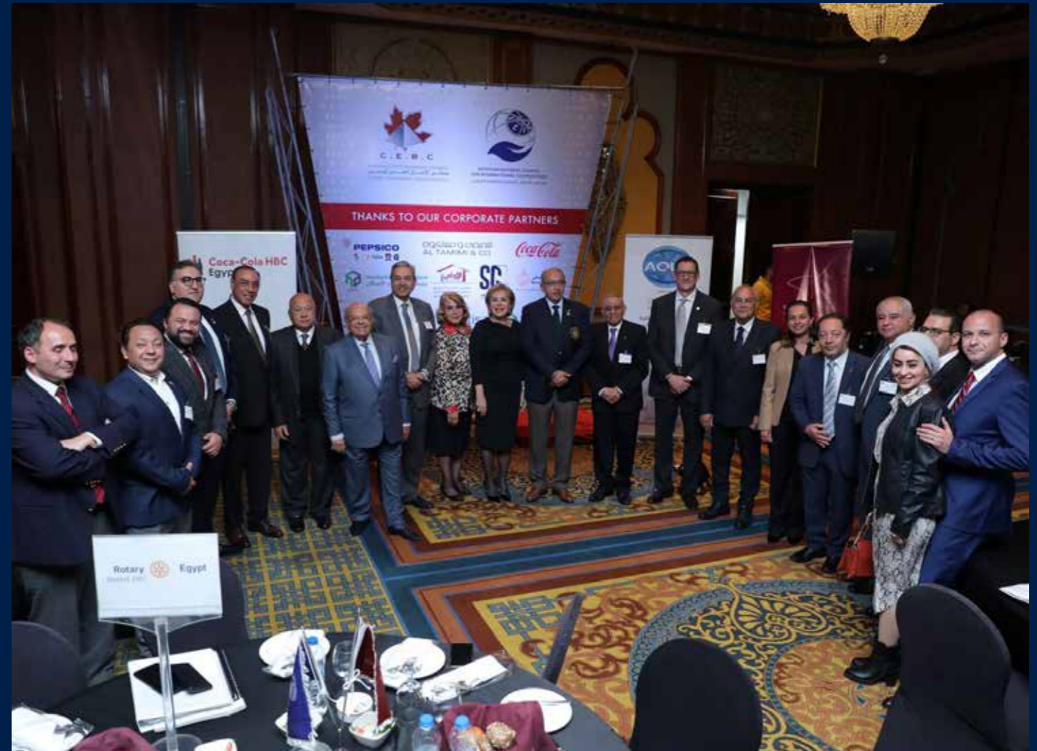
Rotary Egypt and Part from our Distinguished Guests