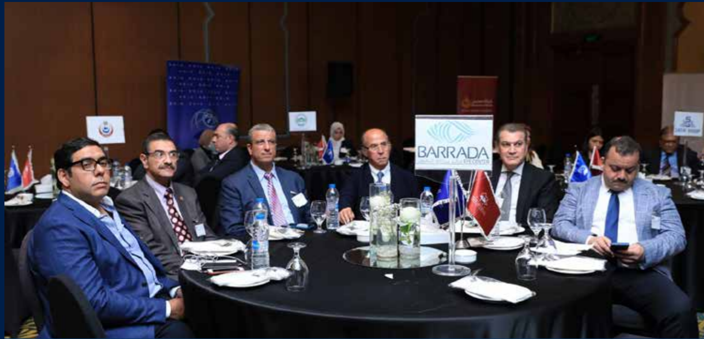
Barrada Eye Center Guests