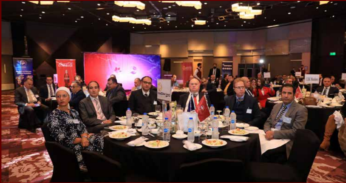
Trans Globe Guests