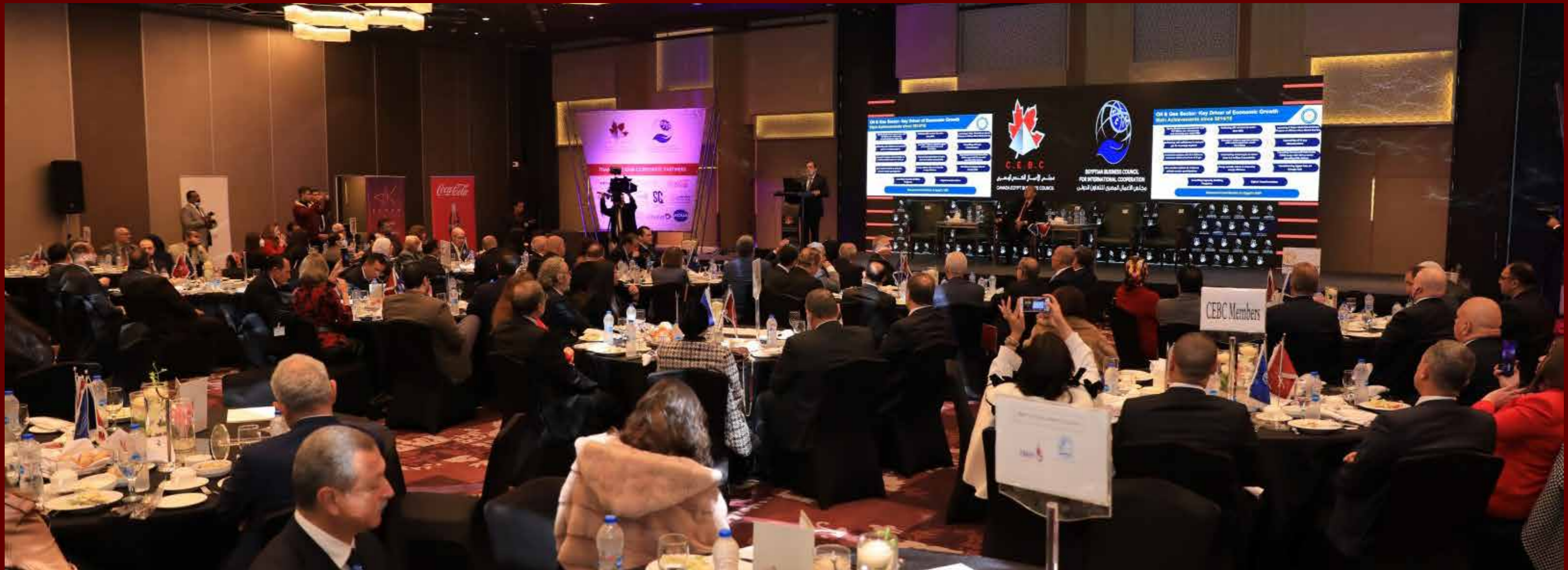
The Panelists & the Attendees