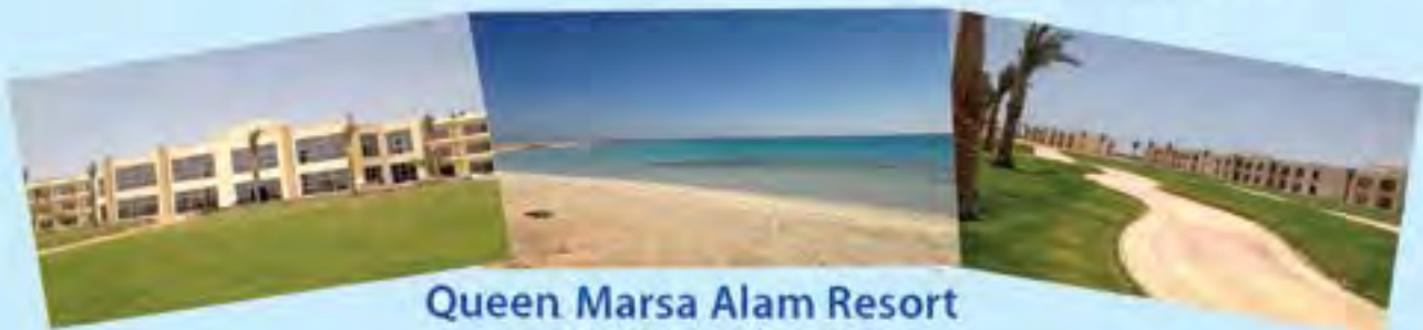
Queen Marsa Alam Resort Marsa Alam