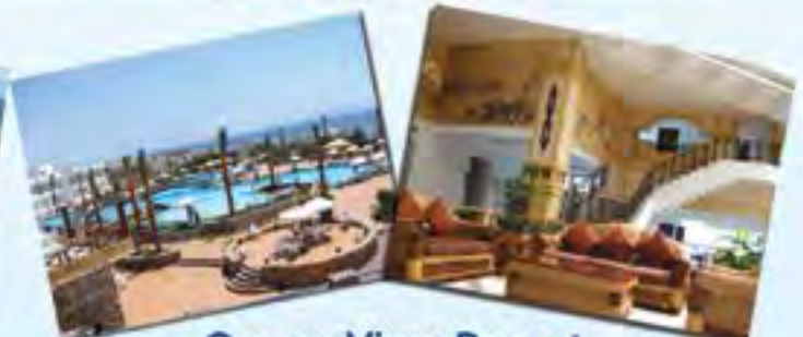
Queen View Resort Sharm El Sheikh