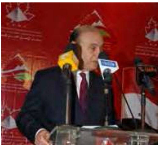
•Admiral Mohab Mameesh

Members of the Council and their guests, the Egyptian minister of Finance, Egypt's former ministers of higher education, administrative