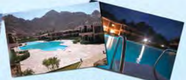
Morgen Land Hotel Saint Catherine