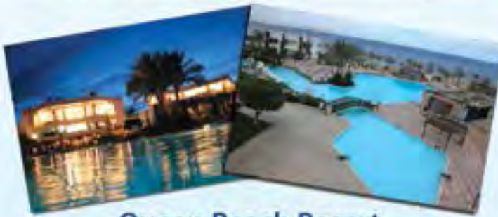
Queen Beach Resort Sharm El Sheikh

Tourism Services, Resorts, Air Ticketing and Transportation.