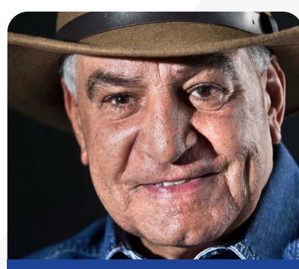
Dr. Zahi Hawass

Chairman of the Canada - Egypt Business Council and the Egyptian Council for International Cooperation, has the honor of inviting you to a seminar held in honor of :