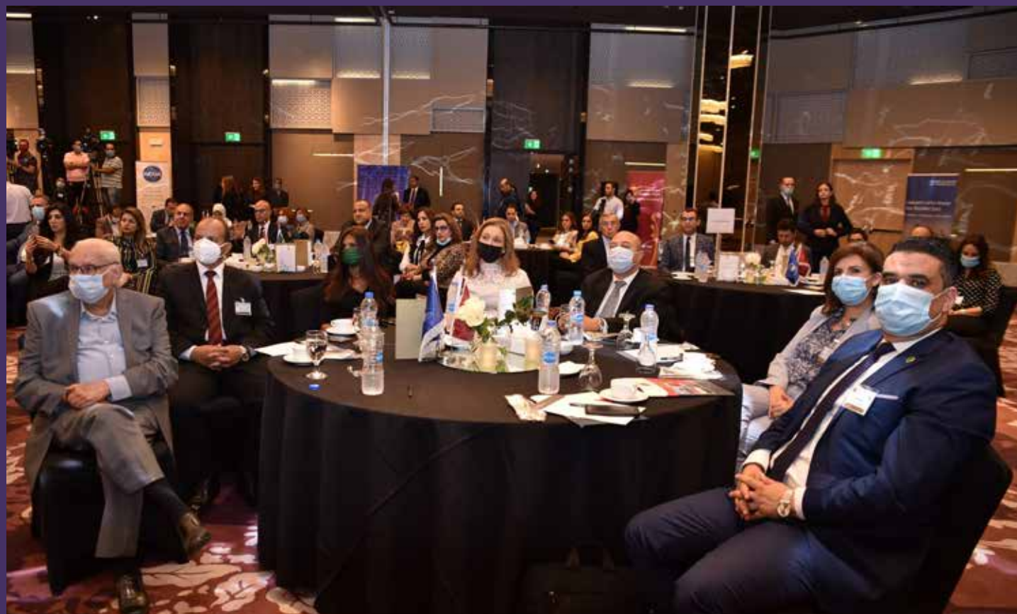
Part from our CEBC & ECIC VIP Guests