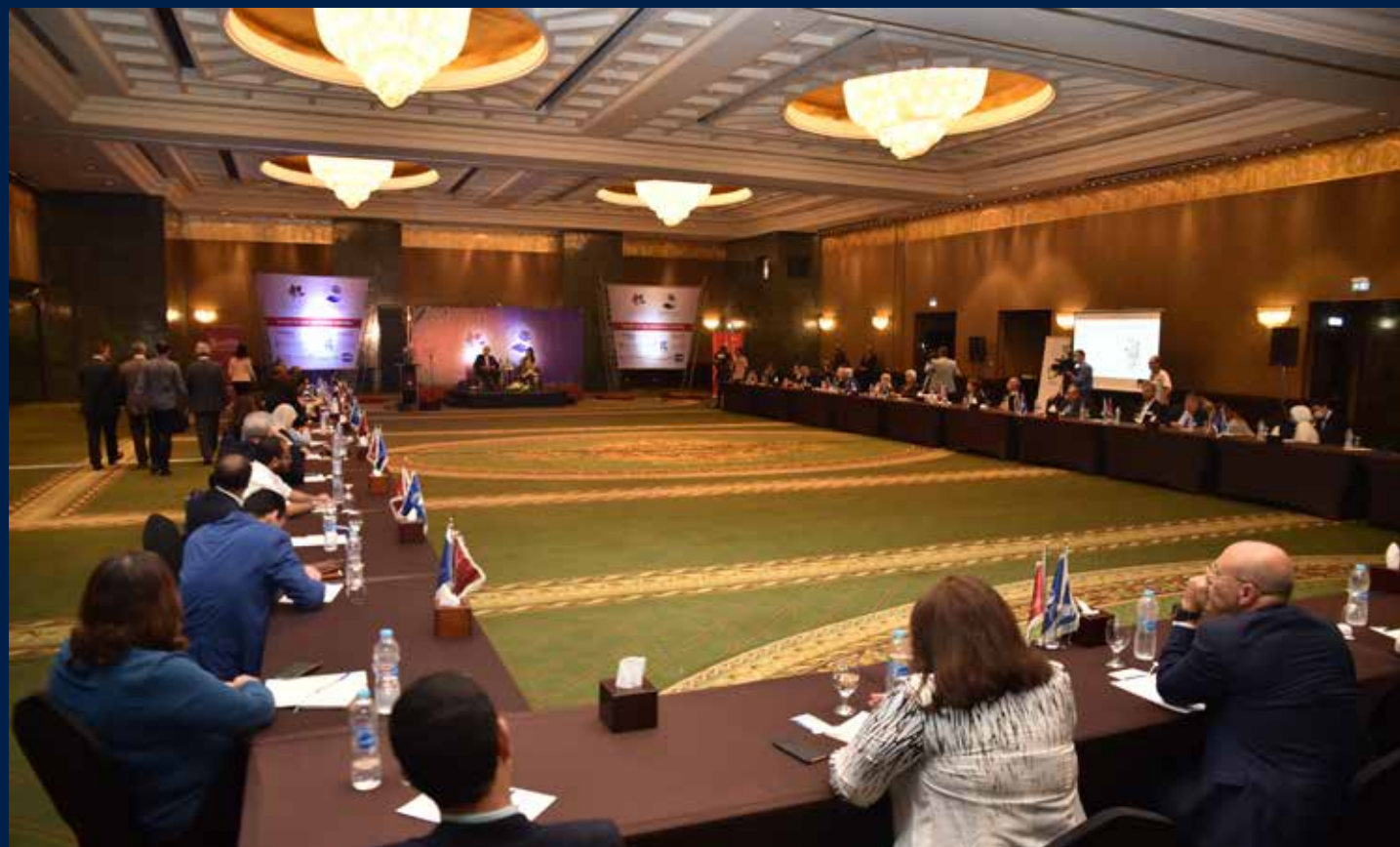
The Panelists & our CEBC & ECIC VIP Guests