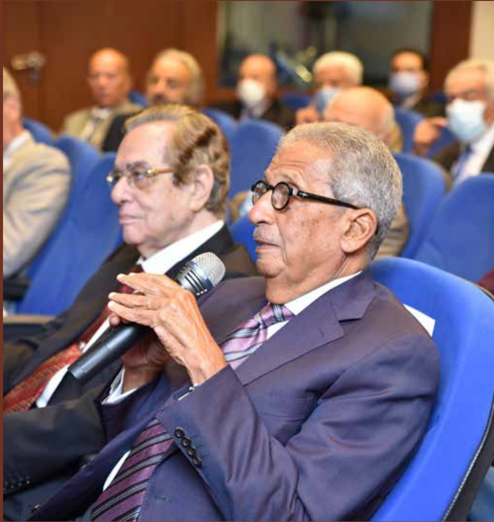
(Q& A) H.E. Amre Moussa