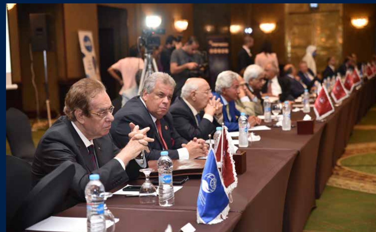
Part from our CEBC & ECIC VIP Guests