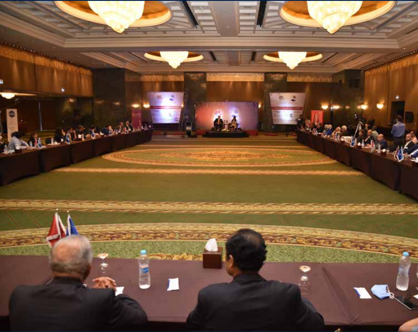
The Panelists & our CEBC & ECIC VIP Guests