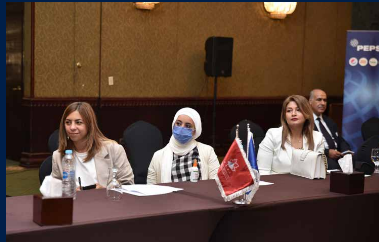
Part from our CEBC & ECIC VIP Guests