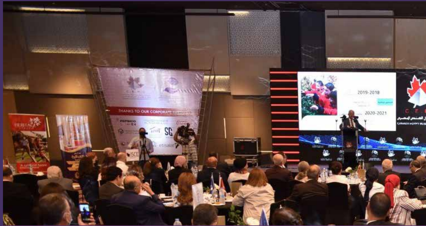
The Panelists & our CEBC & ECIC VIP Guests