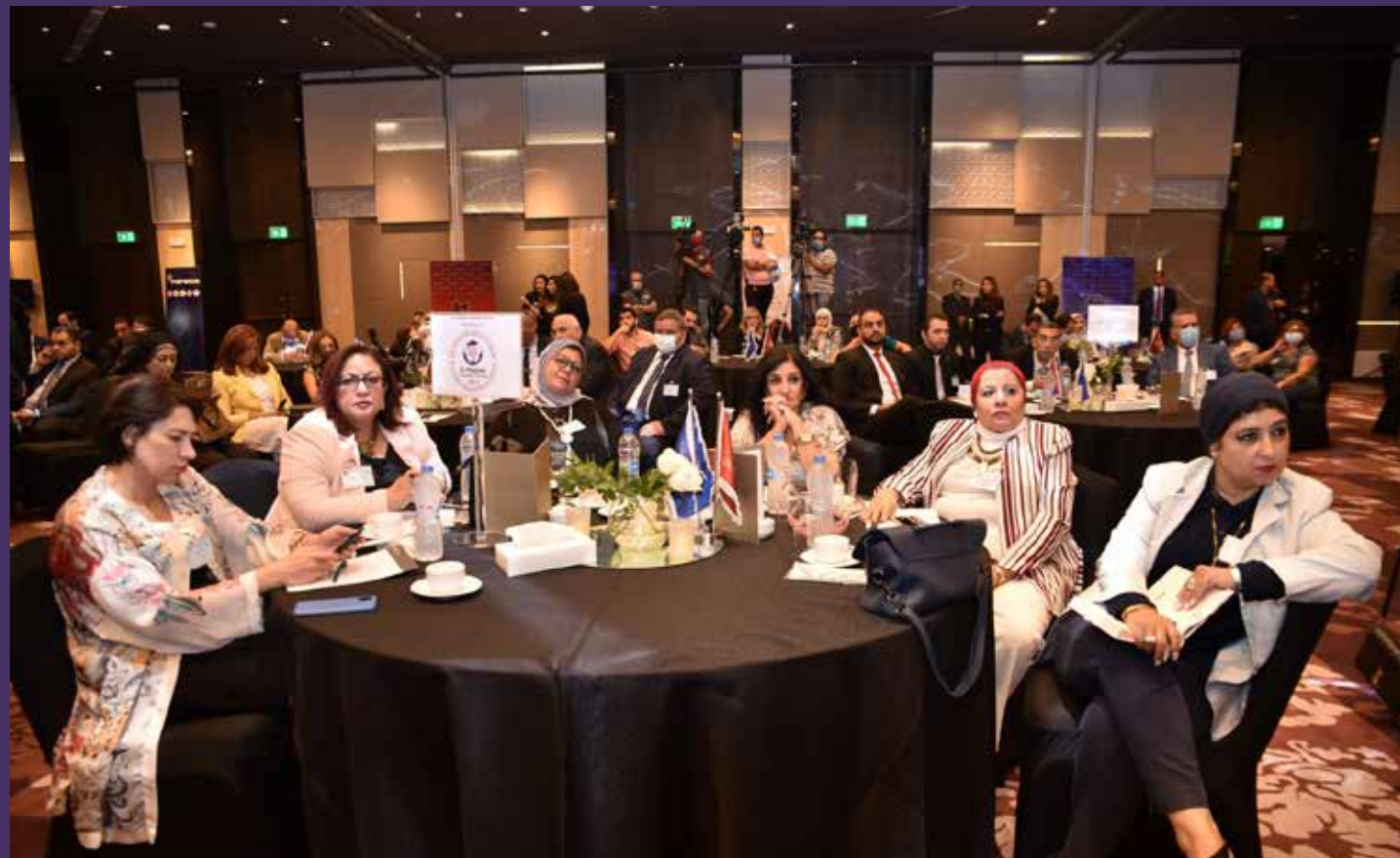
El-Quadah Language Schools Guests