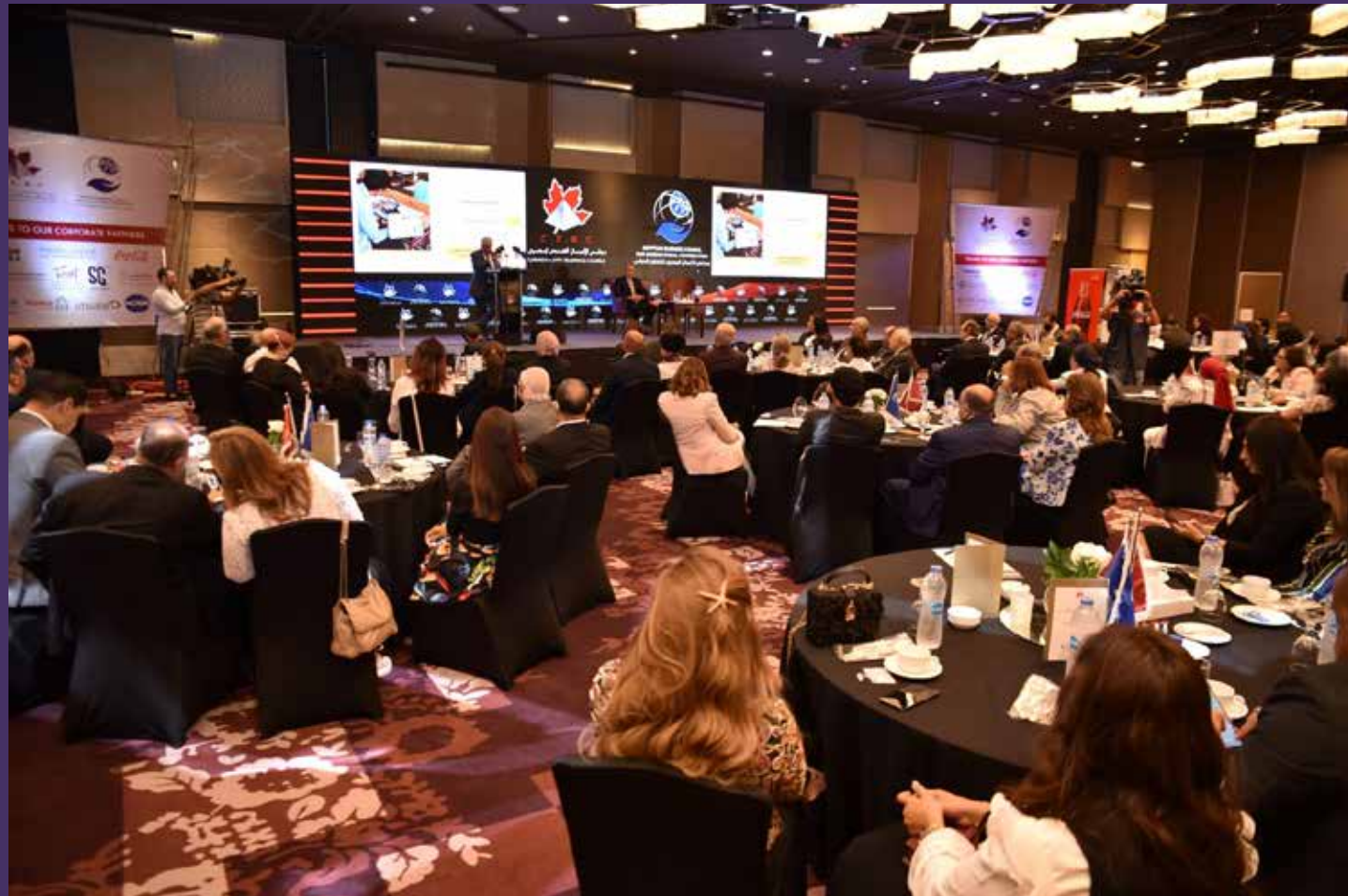
The Panelists & Part from our CEBC & ECIC VIP Guests