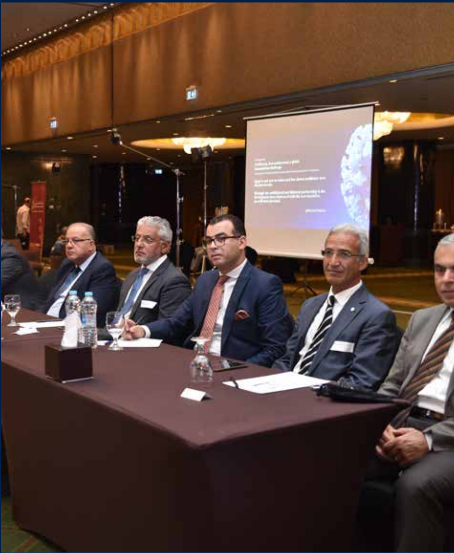
. Part from our CEBC & ECIC VIP Guests