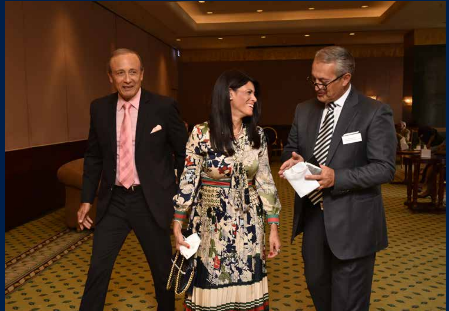
Eng. Motaz Raslan, Chairman - CEBC & ECIC ; H.E. Dr. Rania Al-Mashat, Minister of International Cooperation; Amb. Jugoslav Vukadinovic, Ambassador of the Republic of Serbia

H.E Al-Mashat emphasized that the crisis negatively affected not only health in the world but also the international economy, as it cast a shadow on global production chains, which made unemployment indicators increase, noting that Egypt, under these circumstances, is one of the good growth that was able to deal with challenges. It also managed to create a kind of balance, especially with regard to unemployment, noting that the economic reforms that Egypt adopted years before the crisis helped us a lot, noting that the increase in infrastructure spending rates greatly benefited the Egyptian economy.