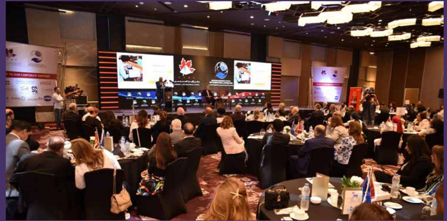
The Panelists & Part from our CEBC & ECIC VIP Guests