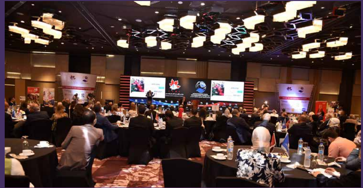
The Panelists & our CEBC & ECIC VIP Guests