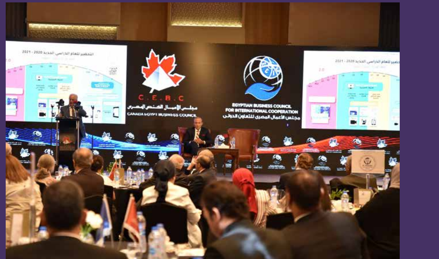
The Panelists & Part from our CEBC & ECIC VIP Guests