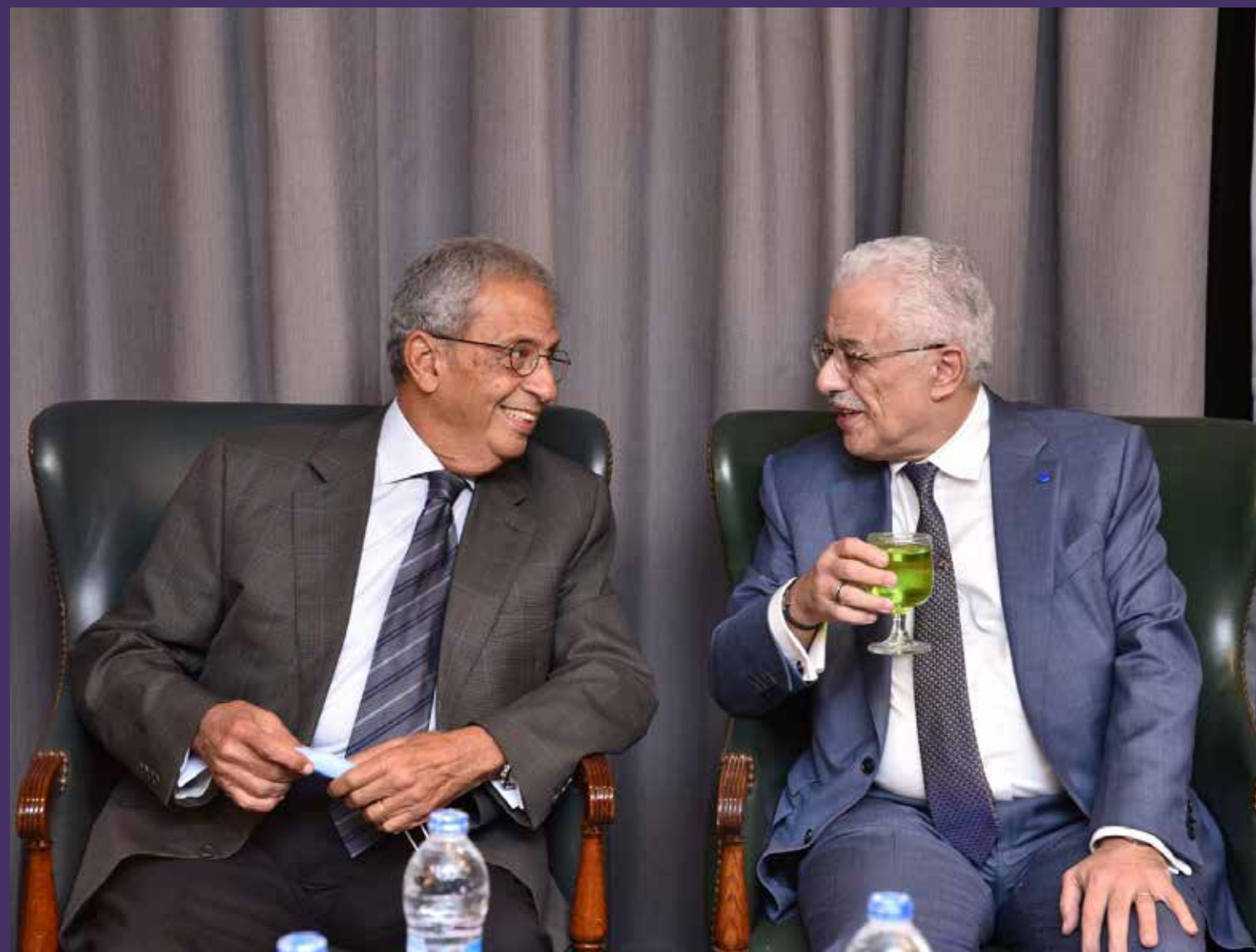
H.E. Amre Moussa; H.E. Dr. Tarek Shawky

Dr. Shawky said, «We own the curricula that were created for the new education system, in addition to our having the question banks for the first time, which helps us transfer our experience to dozens of countries along the lines of international» sat «certificates. He also confirmed that the ministry now has all the capabilities that qualify it to confront the private lessons mafia and the exam leak mafia, indicating that our goal is to preserve the future of our students.