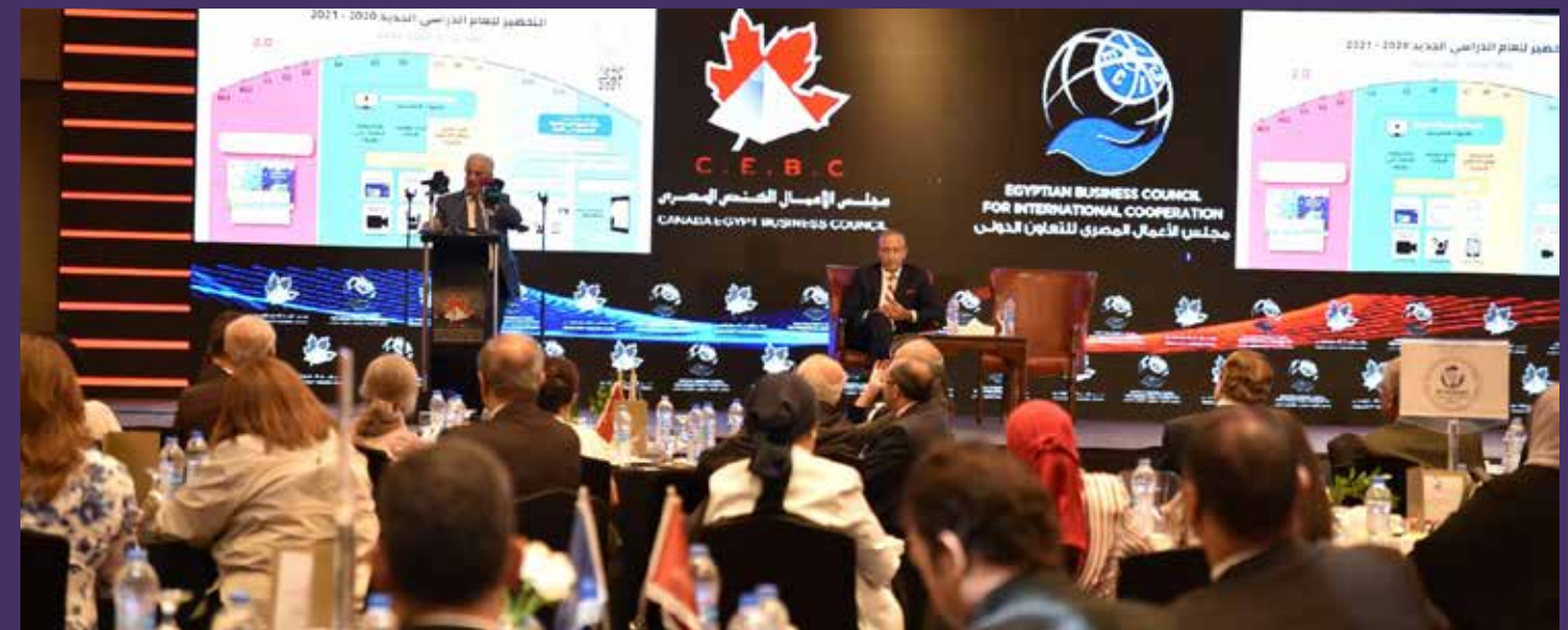
The Panelists & Part from our CEBC & ECIC VIP Guests