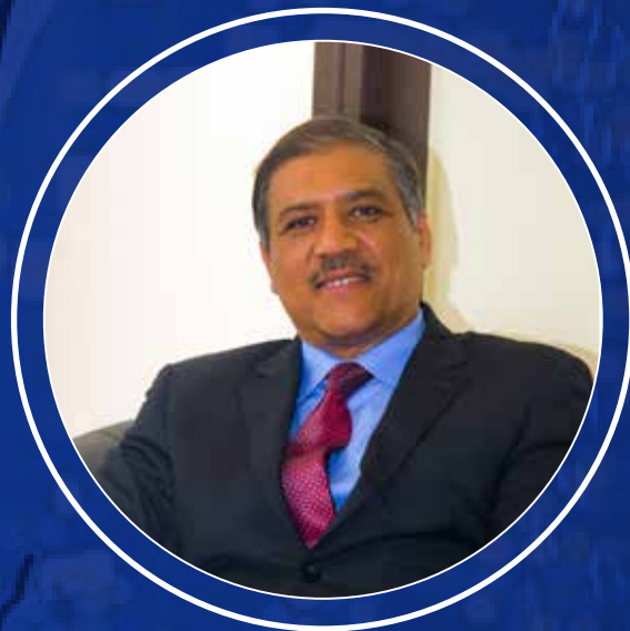
Senator/ Effat El Sadat