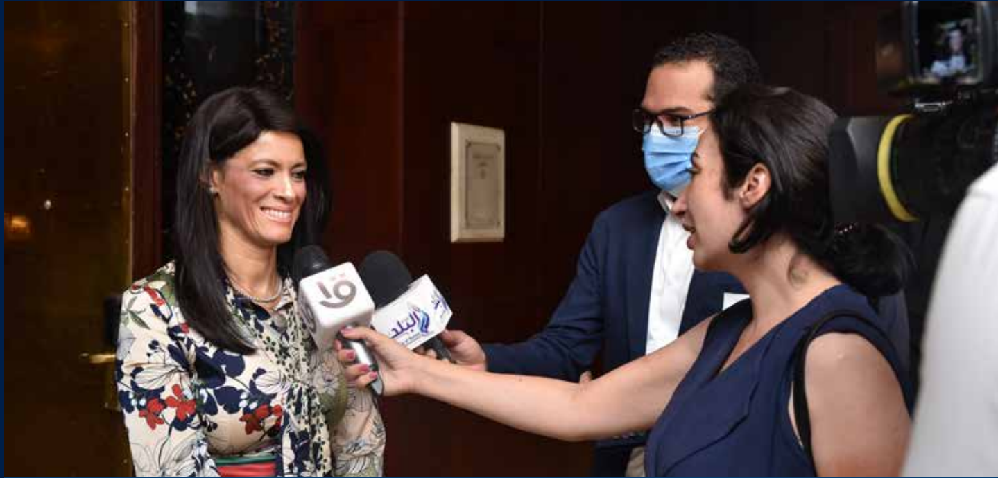
H.E. Dr. Rania Al-Mashat