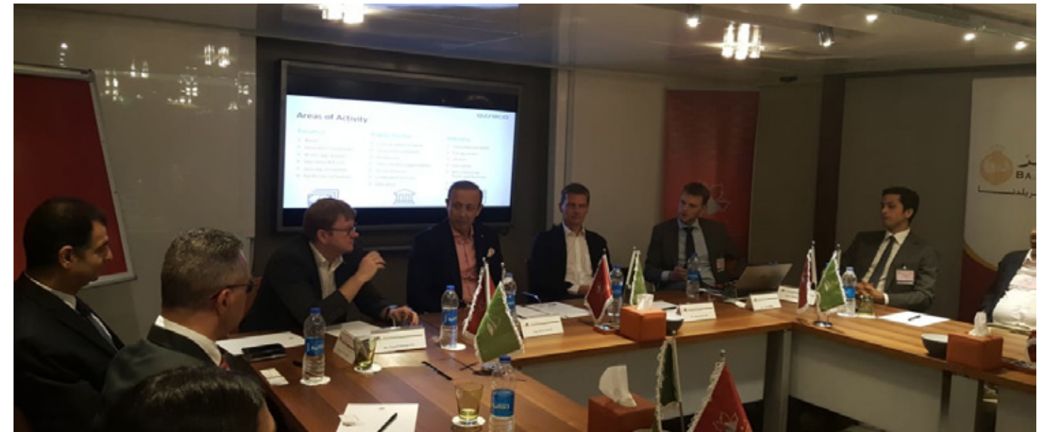
The Panelists & part from our CEBC & ECIC VIP Guests

ASSECO is a well-established IT company based in Poland. It has presence in over than 50 counties, around 25,000 employees. ASSECO is ranks the 6th in the IT business companies in Europe. Their strength comes from working with various business sectors .e.g. Finance Sector, Banking, Insurance companies, Brokerage, Leasing, Factoring companies. Public sector; HealthCare, Uniformed services and Governmental bodies. Industry Sector; Telecommunication, Oil & Gas sector, Energy sector, FMCGs, Manufacturing and Trade services.