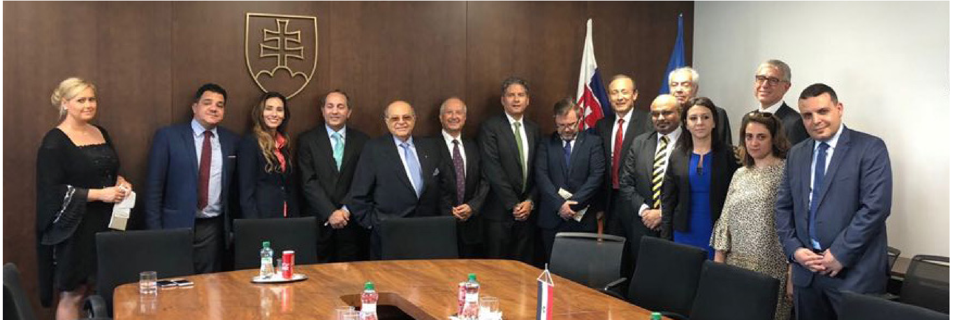
Egyptian Delegation at Ministry of Economy , Bratislava – Slovakia

The agenda of the mission has included holding intensive meetings with a number of senior officials in the ministries of commerce, industry and economy, as well as business organizations and the chambers of commerce and industry, in a way to introduce investment opportunities in Egypt and promote Egyptian commodities and products. Worth mentioning that we received great interest from investors in Slovakia and Poland in the Egyptian market , especially in light of the major projects implemented by Egypt in various sectors.