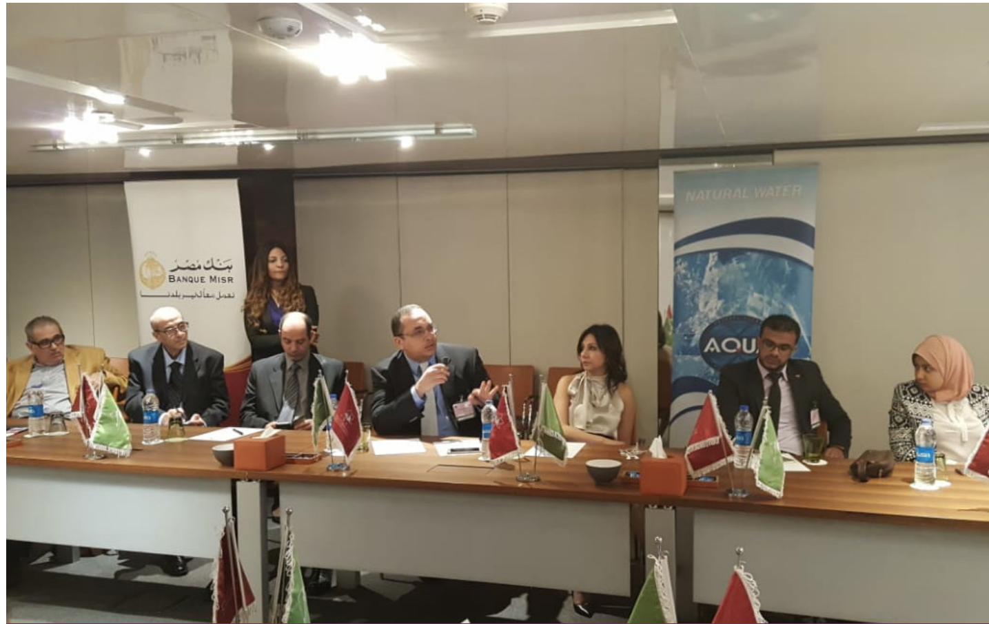
Part from our CEBC &amp; ECIC VIP Guests