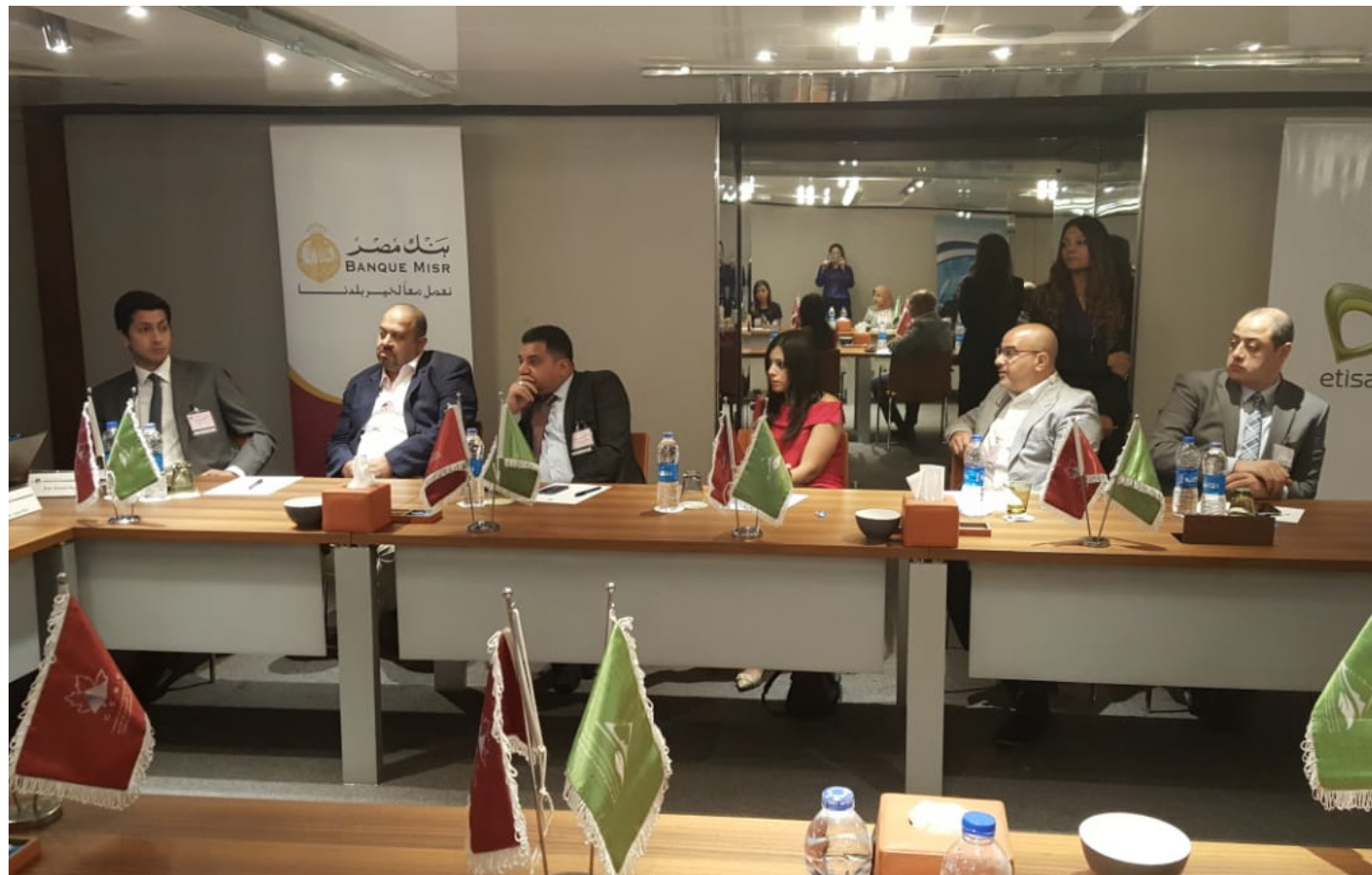
Part from our CEBC &amp; ECIC VIP Guests