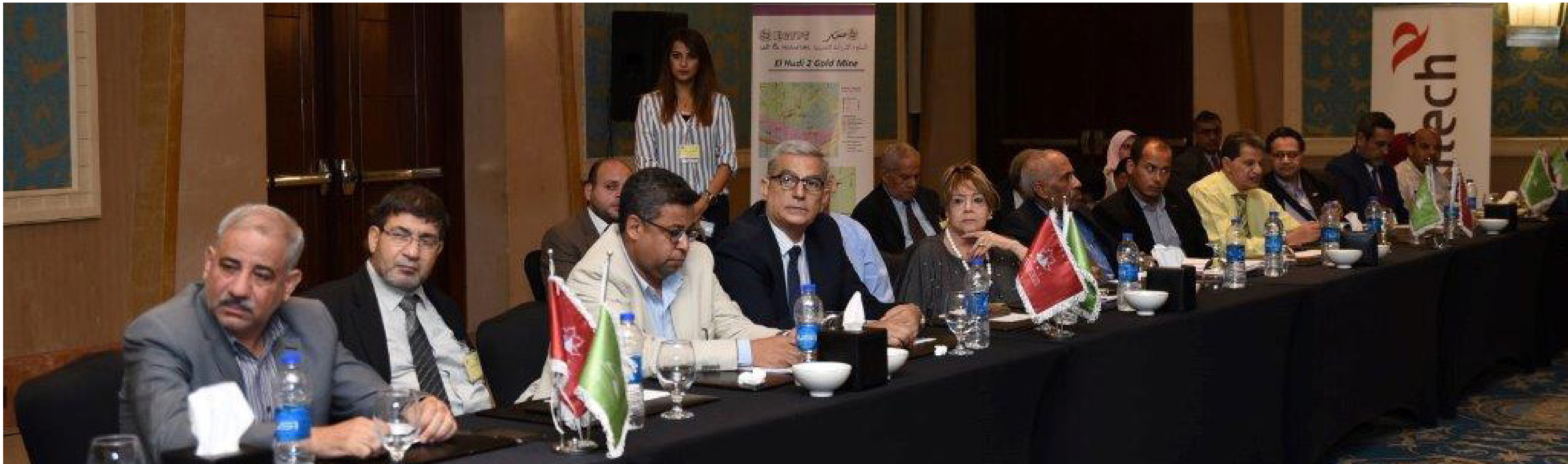
Part of the attendance