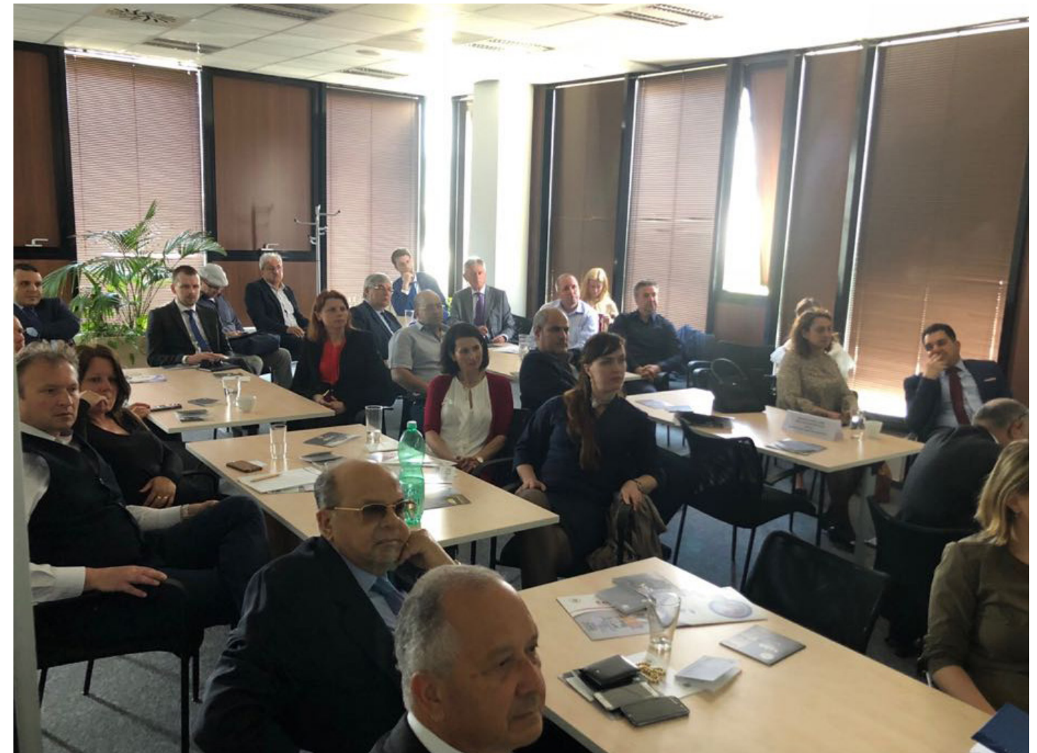
Meeting at SARIO(Slovak Investment and Trade Development Agency), Bratislava – Slovakia