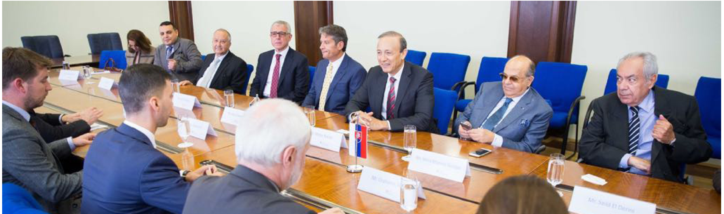
Egyptian Delegation meeting at the Ministry of Foreign Affairs, Bratislava – Slovakia