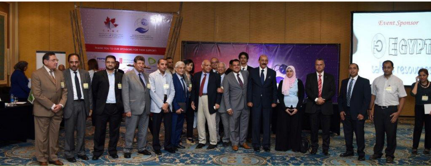
The Panelists & our CEBC VIP Guests