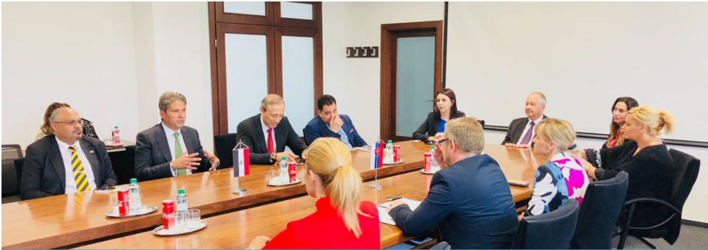
Egyptian Delegation meeting at the Ministry of Economy, Bratislava – Slovakia