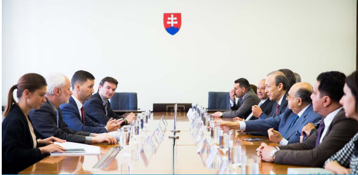
Egyptian Delegation meeting at the Ministry of Foreign and European Affairs, Bratislava – Slovakia