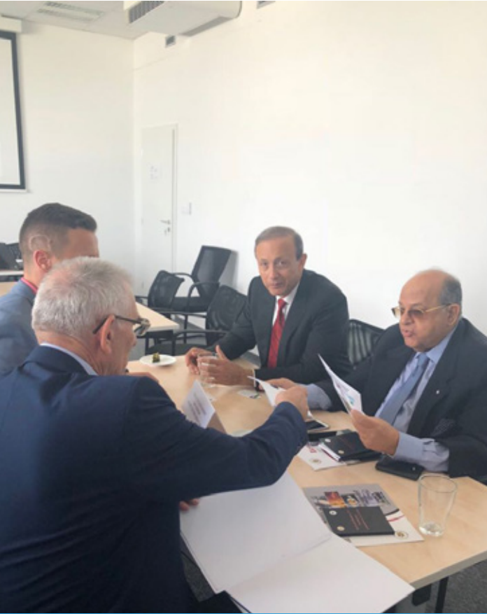
B2B Meetings at SARIO(Slovak Investment and Trade Development Agency), Bratislava – Slovakia