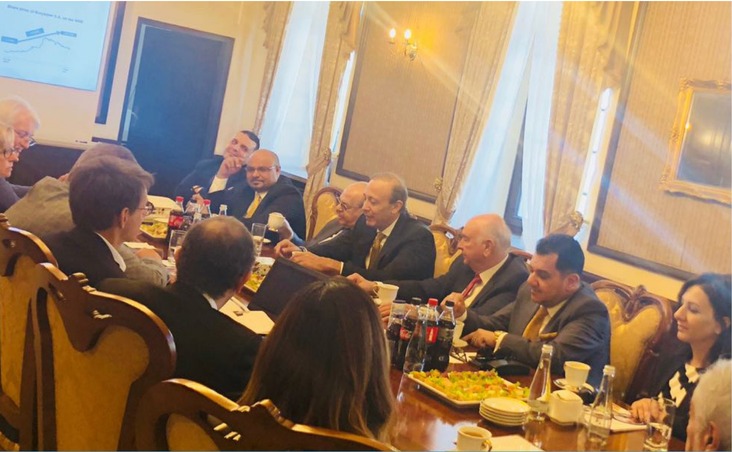
Egyptian Delegation meeting with Mr. Roman Karkosik and his management team, Warsaw- Poland