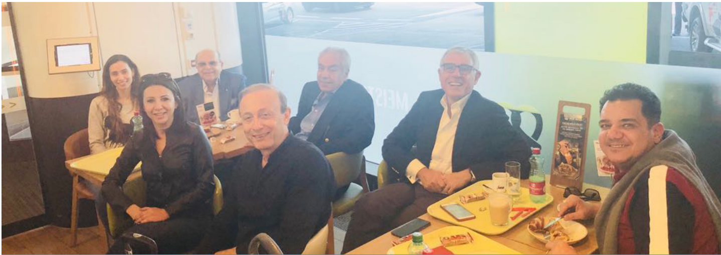
ECIC delegation at Warsaw- Poland Airport