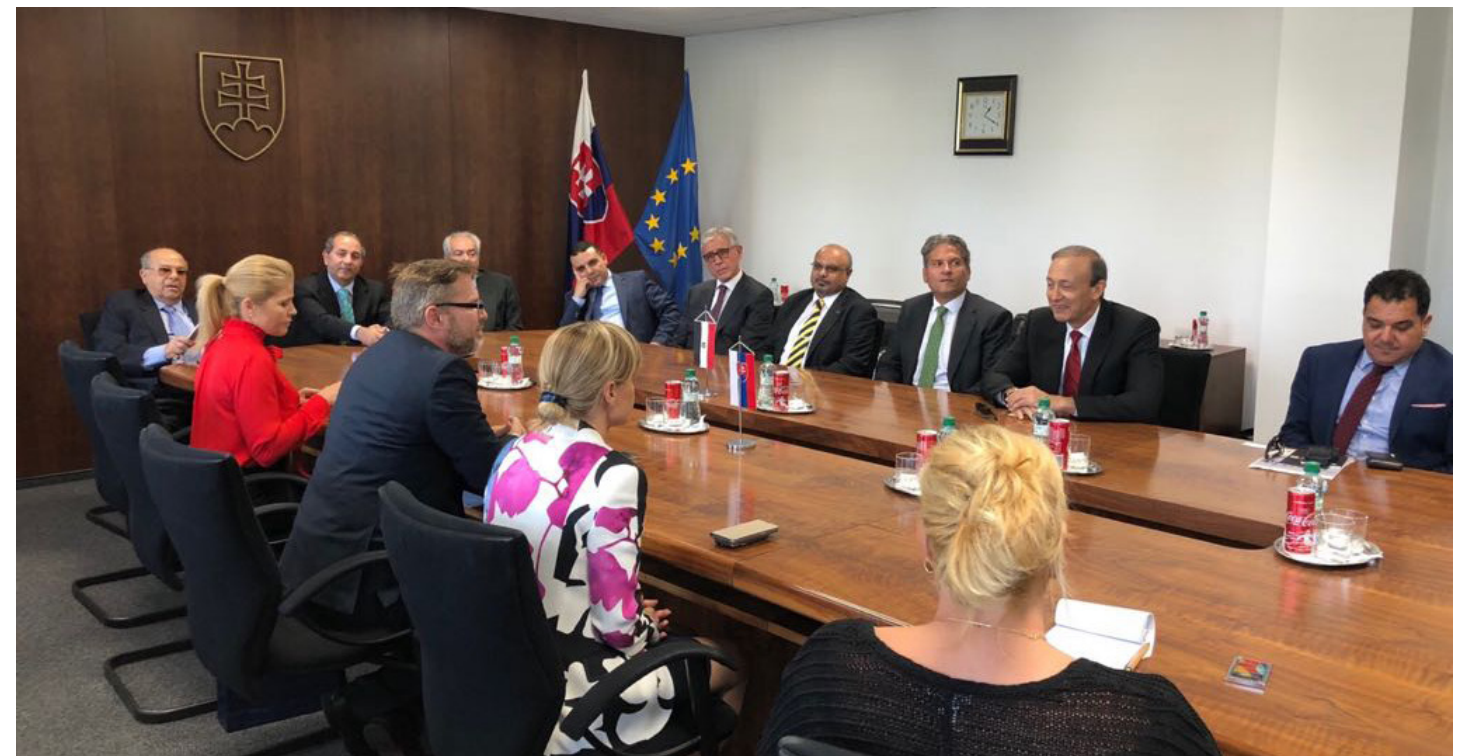
Meeting at the Ministry of Economy, Bratislava ,Slovakia