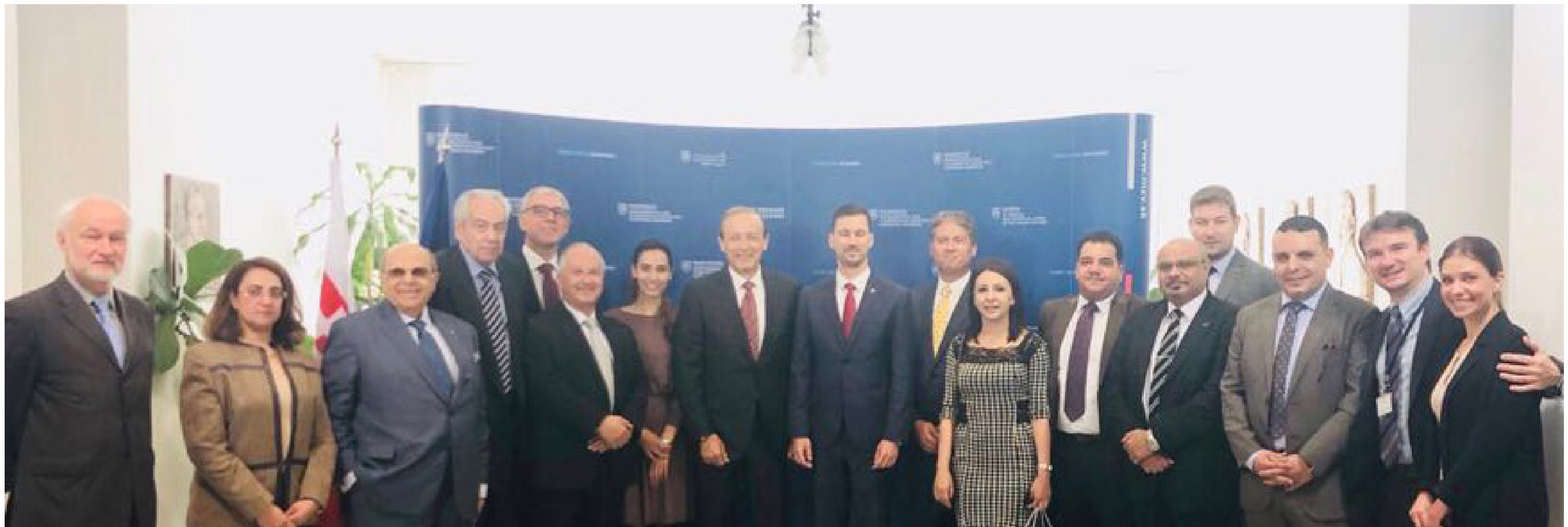
Egyptian Delegation at the Ministry of foreign affairs , Bratislava – Slovakia

This visit has received special attention and very good arrangements, as it was targeting two very important markets. It is also a continuation of our previous missions which achieved great success and opened channels of communication to develop Egypt's trade relations with various partners in Europe. This was achieved in coordination with the Egyptian Foreign Ministry and the two embassies in Warsaw & Bratislava, as well as the embassies of Slovakia and Poland in Egypt.